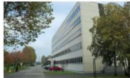
St. Carlo Hospital Rome