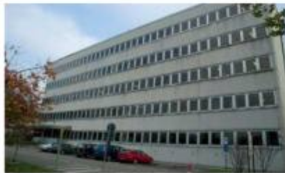
IDI Hospital Rome